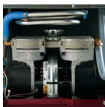
Easy servicing of compressor.